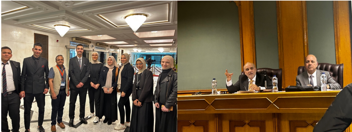
Fig 2: Conference participants (left) and Conference Session Chairpersons (Right) Apart from the Conference presentations, I took the opportunity to photo document my travel and visit few interesting places within the limited time I had.