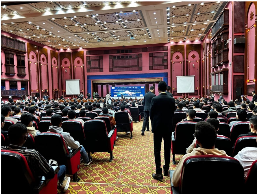
Fig 1 : Conference Inaugural at Al Azhar Conference Center, Al Azhar University, Cairo

I presented my paper in the category "Sustainable Architecture and Urban Design". The presentation was of 17 minutes duration followed by a question and answer session. The presentation was very well appreciated by the peers and participating students of the University. My full paper is accepted to be published in the Journal of Al-Azhar University Engineering Sector (JAUES) special issue and is expected to be ready by April 2024. I look forward to collaborate with the peers in near future.