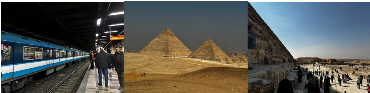
Fig 4: Cairo Metro (Left), Pyramids at Giza (center) and Khufu Pyramid (right)

I had a layover during my onward and return journey at the Bahrain Airport. Through simplistic and futuristic design of the airport, one could feel an architectural brilliance in the way natural light was used and at the same time, artificial light was complemented. So many spatially interesting components itself was live case study, knowledge of which can be transferred to the students at our institute anytime later.